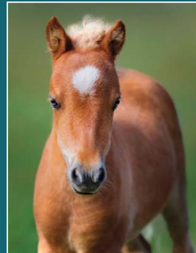
Make new pony friends...

Nature is all around you... from the tranquility of the beautiful countryside with stunning views and walks... to family days out, places to visit and things to do.