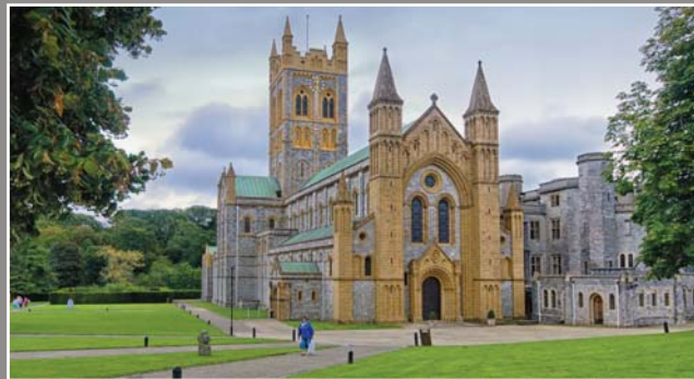
12th Century Riverside Abbey Buckfastleigh TQ11 0EE

The Monks welcome you to their home so you can also experience its unique, tranquil ambience. Enjoy an immersive presentation of Benedictine monastic life from its origins to the present day. Visit the breathtaking Abbey Church which was painstakingly rebuilt over a period of 30 years by just a few monks who formed the core of the workforce. Take a stroll around the gardens (Lavender, Physic, Sensory and Millennium). Browse around the Bookshop, Monastic shop and Exhibition shop and don't forget to pay a visit to the Grange Restaurant whilst there!