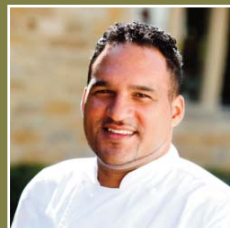
Michael Caines MBE