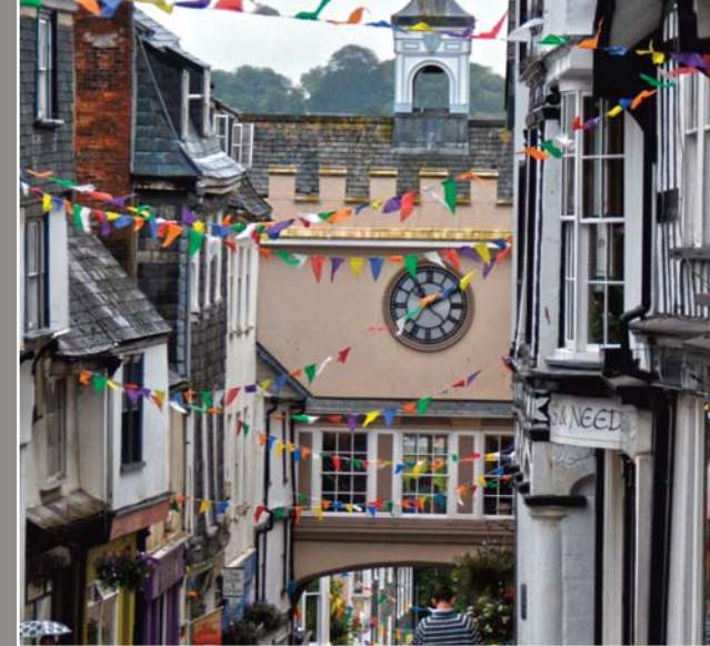
East Gate Arch