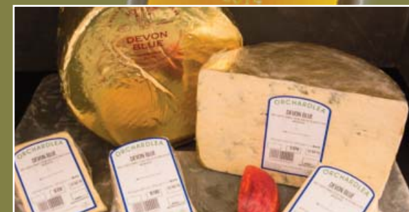
Devon Blue cheese platter by Ticklemore Cheese

Their alfresco restaurant and shop are also a delight and worth a visit.