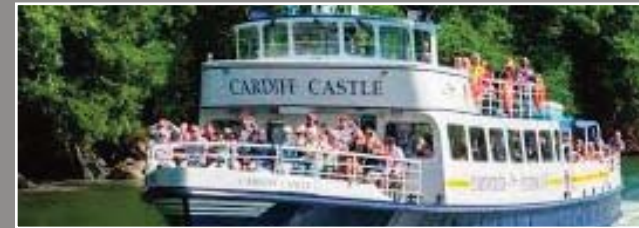
River cruises along the English Riviera