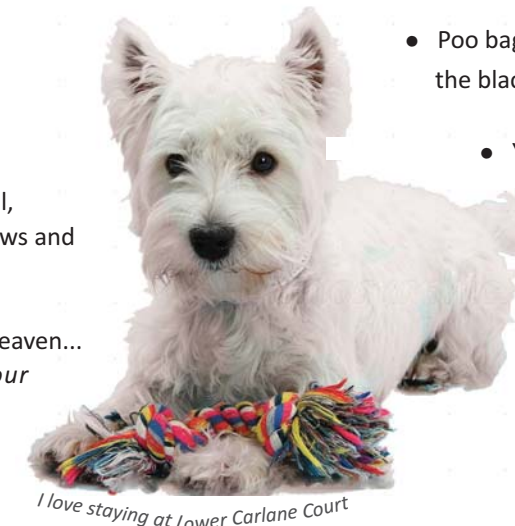
I love staying at Lower Carlane Court

MOST IMPORTANTLY DO NOT LEAVE YOUR DOG(S) ALONE IN LOWER CARLANE COURT