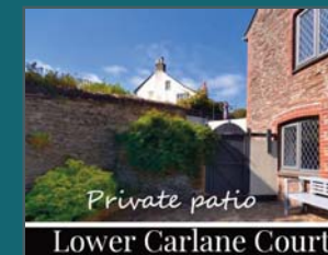
Private patio Lower Carlane Court