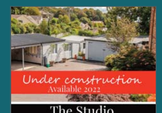
Under construction Available 2022 The Studio

View our 'Home from home' accommodations