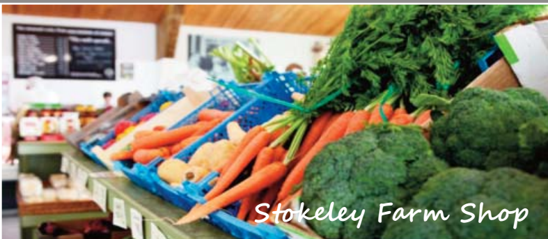
Stokeley Farm Shop