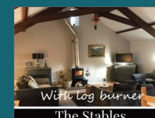
With log burner The Stables