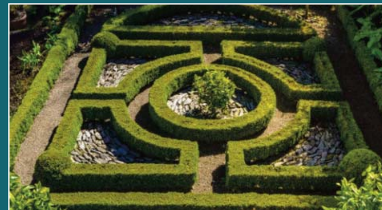
Everywhere you go there is a surprising twist or turn

Email us a photo of you with your creation (plus name age and address) and WE will post YOU a reward!!