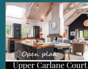
Open plan Upper Carlane Court

Carlane Court is also OUR holiday home - and as our guests, we aim to offer you everything you would expect from a 'Home from home' whilst you are away. Luxury bed linen for a really comfortable sleep, a well stocked kitchen and amenities - and a super clean accommodation are all important to us. With four different private places to stay, you can comfortably holiday with more than one household or extended family at the same time.